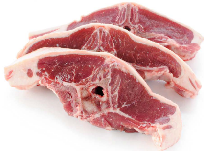
Lamb Chops (Butterfly)