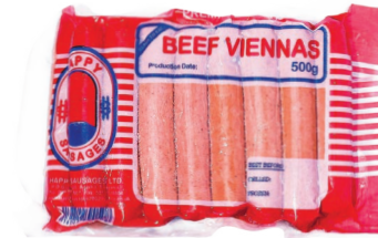
Beef Vienna 500g