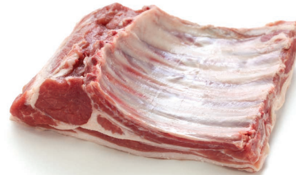
Lamb Ribs - Bulk