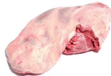
Lamb Leg Boneless