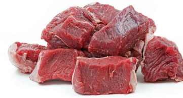
Beef Goulash / Cubes