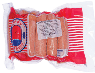
Smoked Beef Sausage