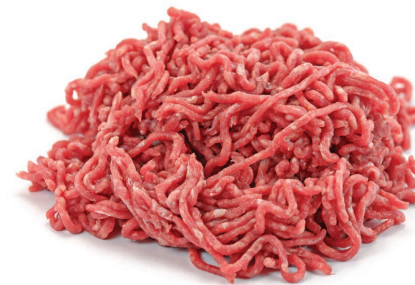
Beef Mince (Topside) 500g | 1000g