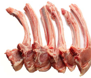
Lamb Ribs - Sliced