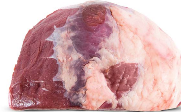
Topside / Beef Roast / Silverside