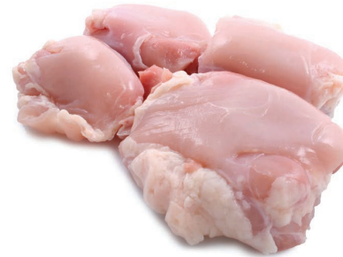
Chicken Thighs (Boneless)