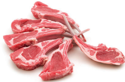
Lamb Loin Chops