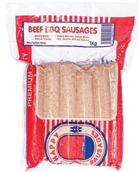
Beef BBQ Sausage