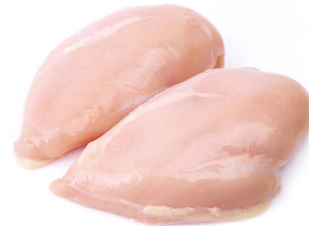
Chicken Breast Boneless