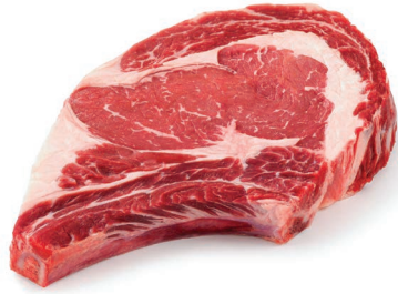
Rib Eye Steak